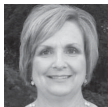
Kahla Petersen Deluxe Print & Promotions Springfield